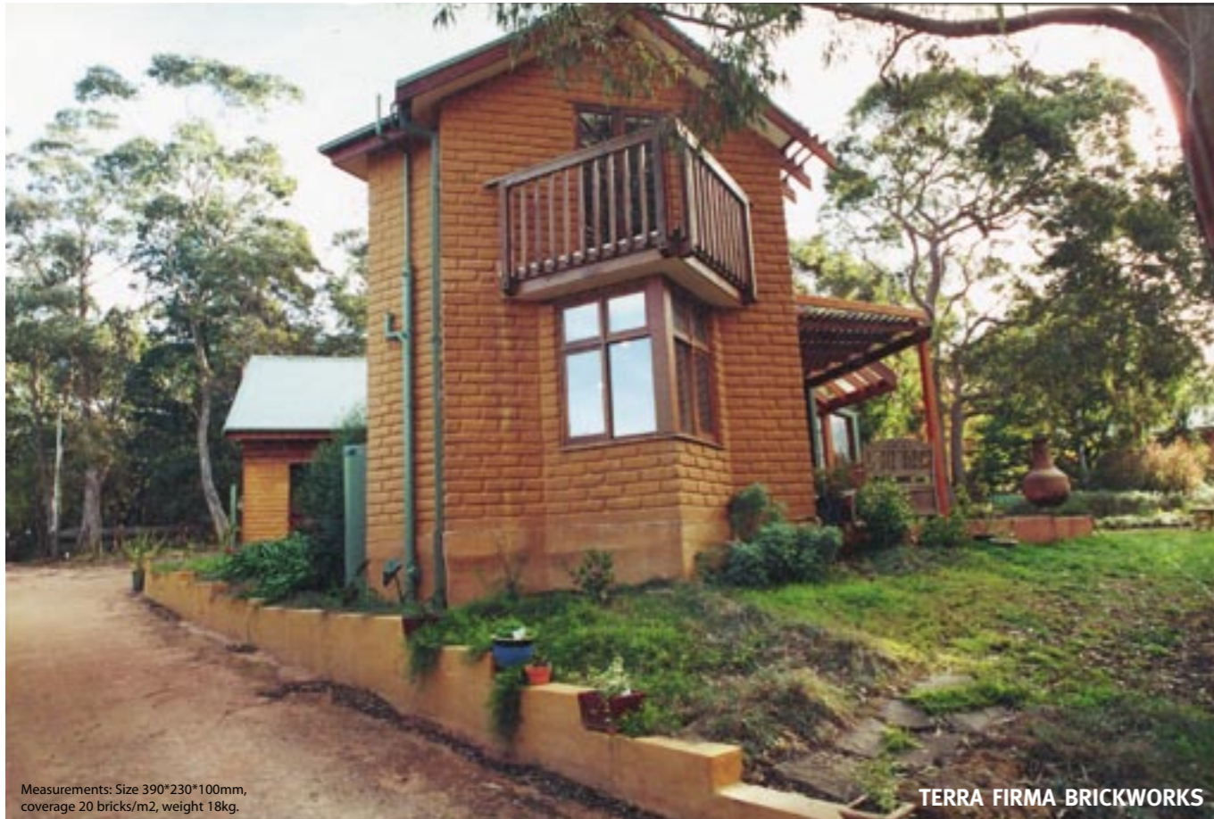
Measurements: Size 390*230*100mm, coverage 20 bricks/m2, weight 18kg.