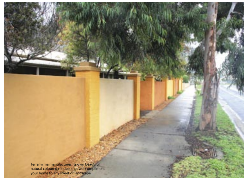
Terra Firma manufactures its own beautiful natural coloured renders that will compliment your home to any street or landscape

The company uses new environmentally sensitive methods of manufacturing to ensure its bricks are made efficiently and ecologically. Terra Firma Brickworks offers free sample bricks for you to take home and consider, and has a superior service in which the company not only supplies the chosen bricks, but can lay them and provide on-site assistance. +